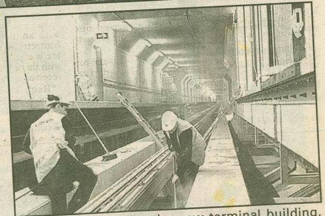
Almost complete . . . the new terminal building, top, and above, workmen put the finishing touches to the track system.

"The new satellite will give provision for more than two million passengers a year."